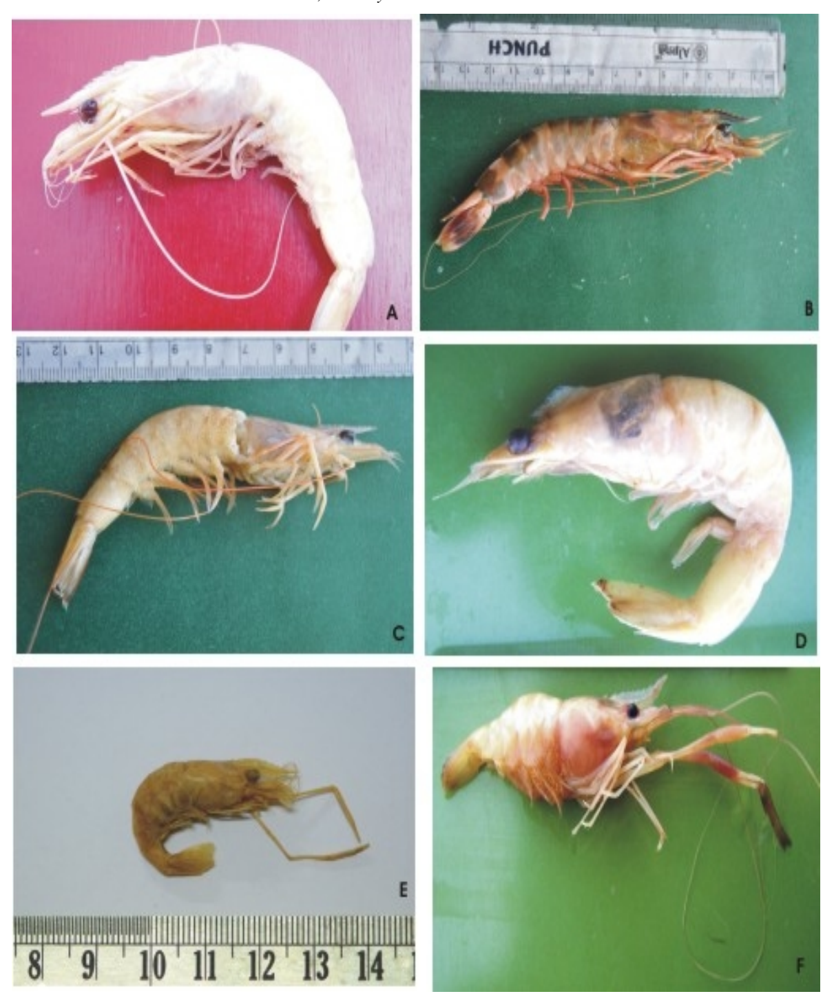
Fig. 3. (A). Melicertus canaliculatus (Olivier, 1811) (B). Mierspenaeopsis sculptilis (Heller, 1862), (C) Metapenaeus ensis De Haan, 1844, (D). Metapenaeus lysianassa (de Man, 1888), (E). Macrobrachium banjare (Tiwari, 1958), (F). Macrobrachium equidens (Dana, 1852).